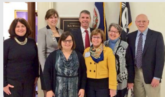
VSBA members meet with Representative Rob Wittman (VA-01).

Thank you to all of those board members who participated in the 2015 Advocacy Institute and Day on the Hill. VSBA looks forward to continuing to work with all of our board members and members of Congress to ensure a robust public education system for the Commonwealth.