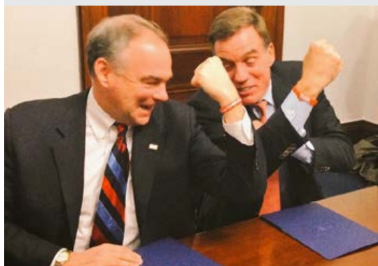
Senators Mark Warner and Tim Kaine show their support for NSBA’s “Stand Up 4 Public Education” campaign.