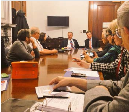
VSBA members meet with Senators Mark Warner and Tim Kaine