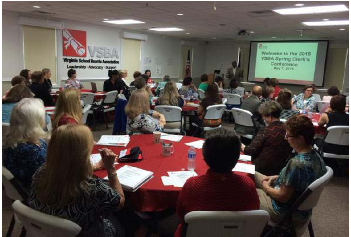
VSBA CLERKS CONFERENCE – School board clerks from across the Commonwealth came together in Charlottesville for a day of professional development and training.