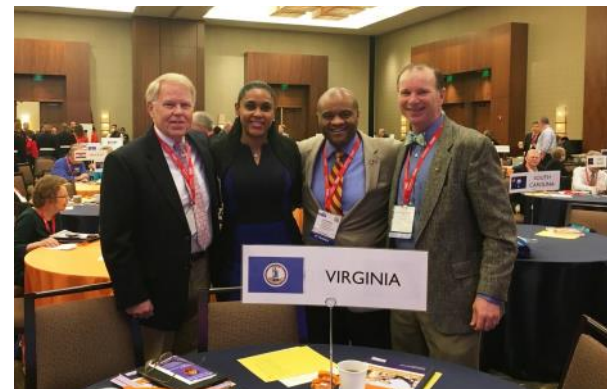
NSBA Conference, April 9—11, Boston, Massachusetts