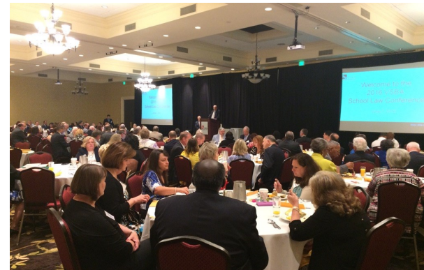
VSBA School Law Conference in Charlottesville, VA