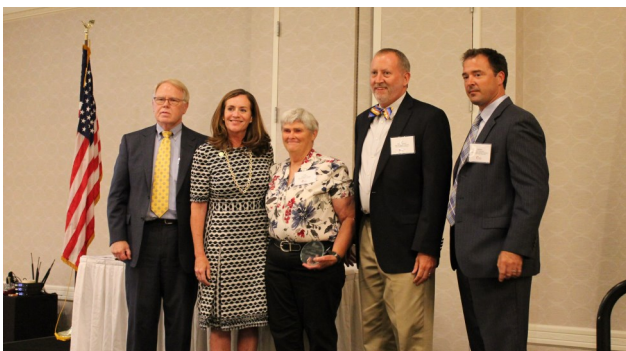
ISLE OF WIGHT COUNTY PUBLIC SCHOOLS