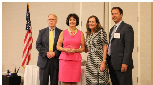
CHESAPEAKE CITY PUBLIC SCHOOLS