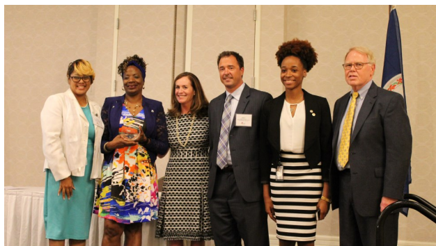
RICHMOND CITY PUBLIC SCHOOLS