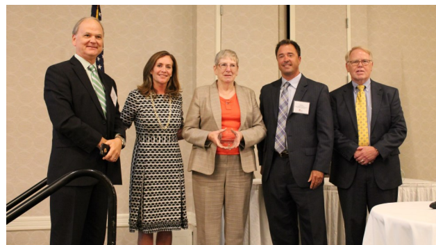
MECKLENBURG COUNTY PUBLIC SCHOOLS