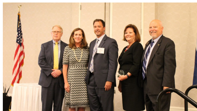
MANASSAS CITY PUBLIC SCHOOLS

Chesapeake City Public Schools (Above 10,001 Student Population)