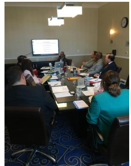
Members of the VSBA Task Force on Schools in Challenging Environments meet at the VSBA School Law Conference

Finally, the summer provides excellent opportunities for each of you to visit with your local legislators while they are in their home offices. Perhaps consider inviting them to a board meeting for recognition. As always, I encourage you to continue looking for ways you can improve the opportunities for students through collaborative partnerships with businesses and other organizations within your communities. It's an honor and pleasure to serve you. See you at the VSBA Conference on Education July 18th in Richmond.