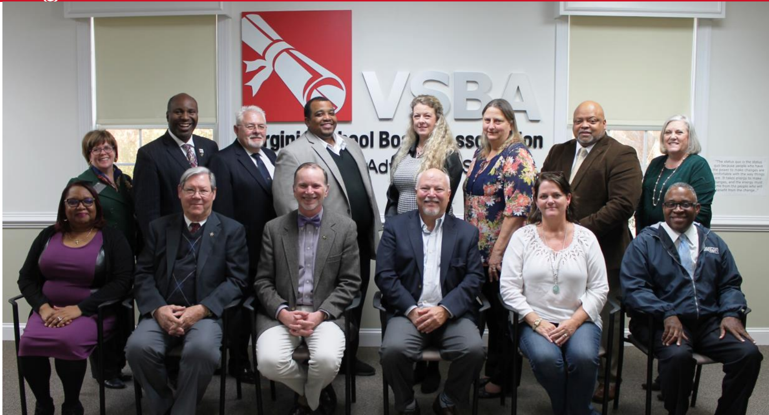
"The status quo is the status quo because people who have the power to make changes are uncomfortable with the way things are. It takes energy to make changes, and the energy must come from the people and not result from the change."