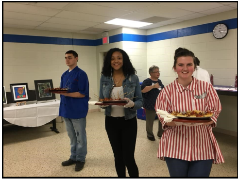
Caroline County Students Serving Dinner at the Eastern Forum