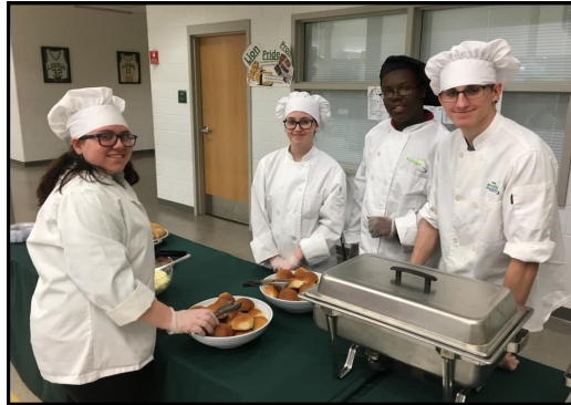
Louisa County Students Serving Dinner at the Central Forum