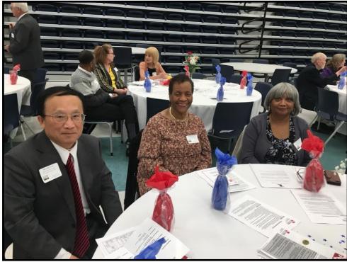
Attendees at the Southern Forum