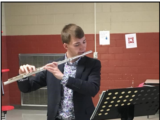
Student Performer at the Blue Ridge Forum