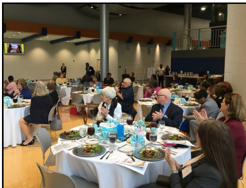
Attendees at the Tidewater Forum