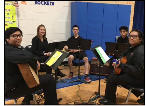
Manassas City Performers at the Northeastern Forum