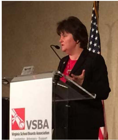
Virginia Secretary of Education Anne Holton

This year's Capital Conference included greetings from the new Virginia Secretary of Education Anne Holton, commentary on the "big picture" of Virginia's political scene, an overview of the governor's budget, and an update on legislation being considered in the General Assembly. The conference included a reception that was attended by 35-40 delegates and senators, and fellow school board members conducting many productive visits with legislators.