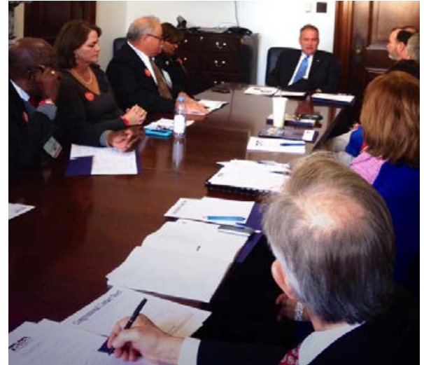
Virginia delegation with Senator Tim Kaine.