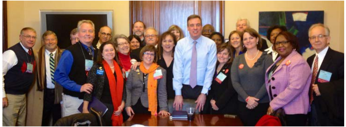
Virginia delegation with Senator Mark Warner.