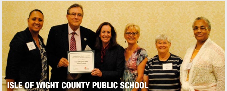
ISLE OF WIGHT COUNTY PUBLIC SCHOOL