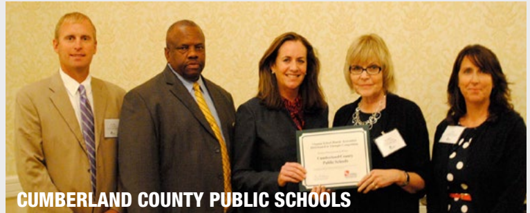
CUMBERLAND COUNTY PUBLIC SCHOOLS