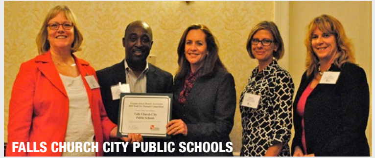
FALLS CHURCH CITY PUBLIC SCHOOLS