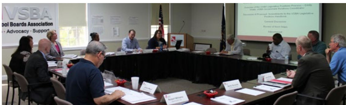
Members of the VSBA Legislative Positions Committee review proposals submitted by local school divisions, which were then recommended to the VSBA Board of Directors. These recommendations will be voted on by the Delegate Assembly at the Annual Convention and, if approved, become part of the VSBA Legislative Positions Handbook.