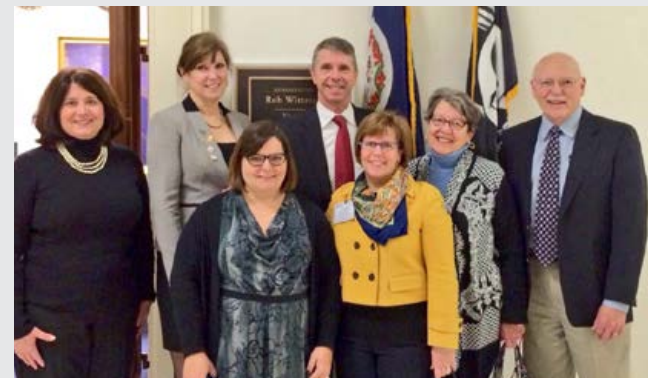
VSBA members meet with Representative Rob Wittman (VA-01).

Thank you to all of those board members who participated in the 2015 Advocacy Institute and Day on the Hill. VSBA looks forward to continuing to work with all of our board members and members of Congress to ensure a robust public education system for the Commonwealth.