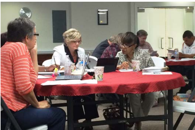
September 1—VSBA Superintendent Evaluation Workshop Charlottesville, VA