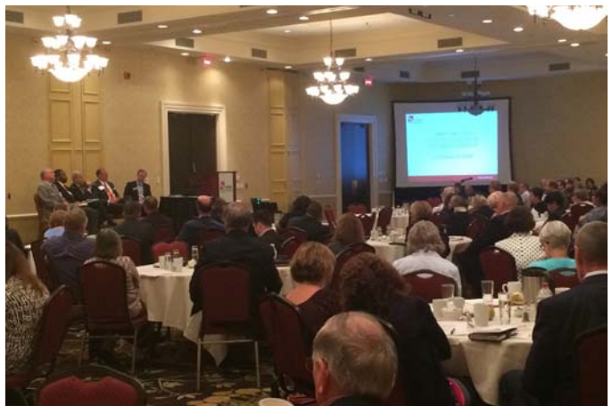
September 10—VSBA Legislative Advocacy Conference Charlottesville, VA