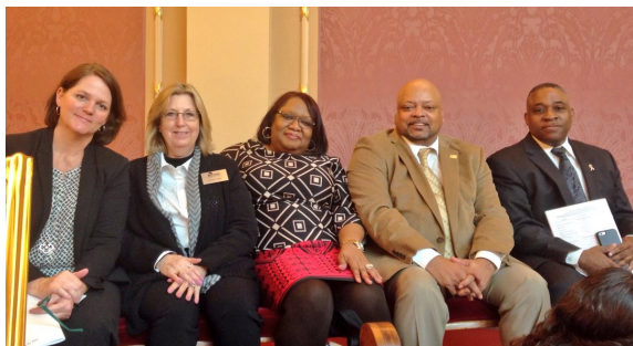
VSBA regional chairmen and vice-chairmen watch the floor session of the Virginia Senate from the gallery.