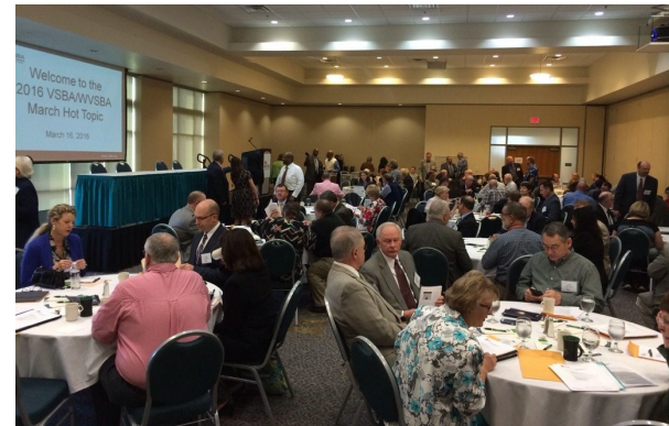
March VSBA Hot Topic Conference on Workforce Readiness in Wytheville, VA