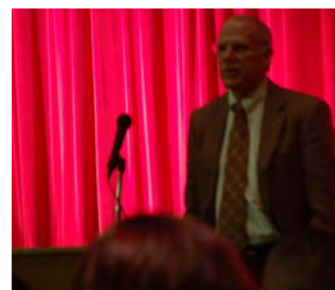
TYLTSM 2012, Senator Frank Ruff visiting Rustburg High School (Campbell County)