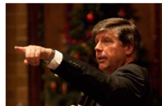
TYLTSM 2012, Senator Steve Newman answering questions for Brookville High School government students (Campbell County).