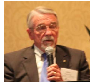
The Honorable Dickie Bell, 20th District, Virginia House of Delegates