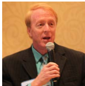
The Honorable George Barker, 39th District, Senate of Virginia