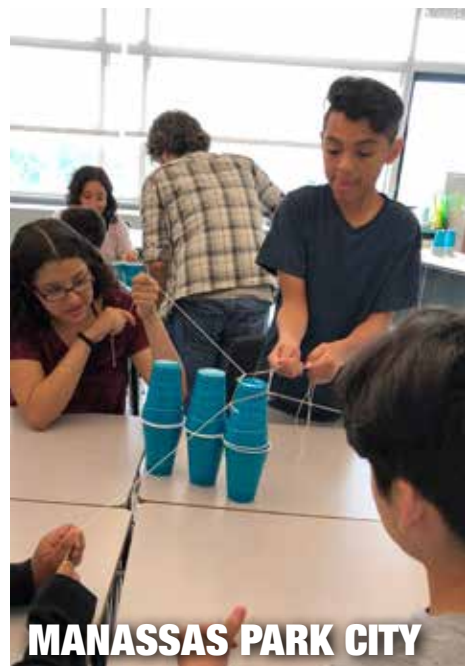
MANASSAS PARK CITY