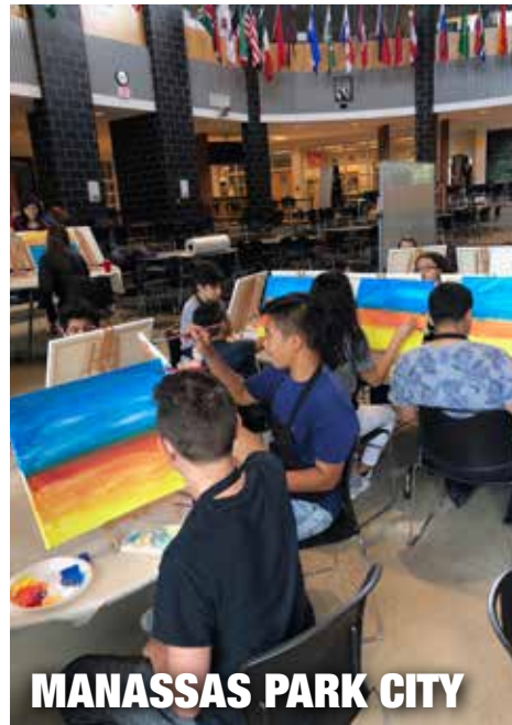
MANASSAS PARK CITY