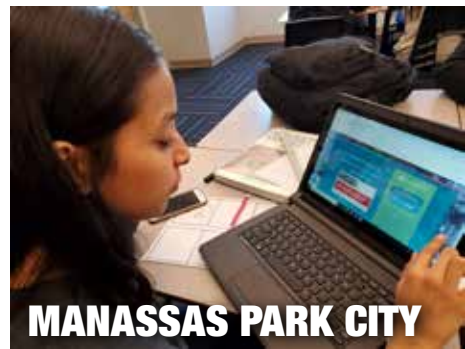
MANASSAS PARK CITY